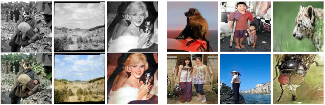
Figure 1: Examples of successfully (left) and failed (right) colorized images [1].

The PostProdLEAP research project, in partnership with the Composite Films company based in Paris, is interested in the problem of (semi)-automatically colorizing archive images or videos. Recent methods for colorization are often based on convolutional neural networks trained on large datasets of natural color images [1] (see Figure 1). Generated colors must be semantically accurate, e.g. , sky is usually blue, and relevant according the image objects, e.g. , avoid color bleeding outside an object or inconsistent colors for the same objects.